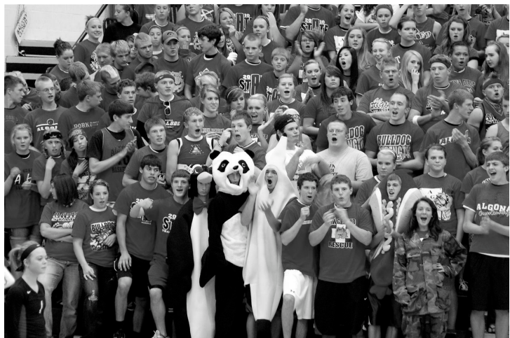
Above: The Dawg Pound cheers on the volleyball team.